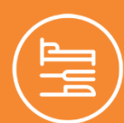
hospitality & tourism