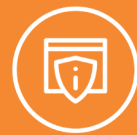
IT & technology